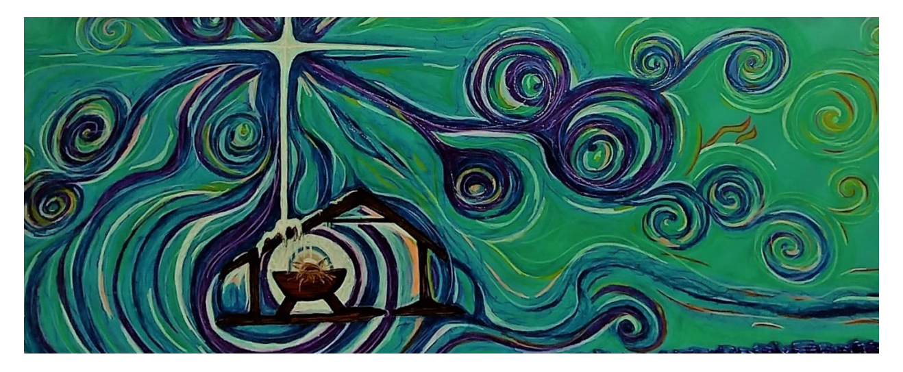
"Making Jesus Known by Sharing Our Gifts"